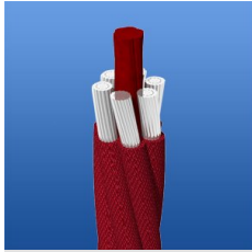
Climbing Net - 20 mm